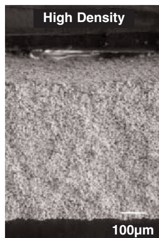
3M™ Empore™ Extraction Disk 8-16 µm particle size

The dense particle packing and uniform distribution within SD and HD Empore disks provide efficient and reproducible sample preparation. The diffusion distance between particles is minimized, adsorption is more efficient, and extraction can be accomplished using less sorbent mass to provide the following performance gains: