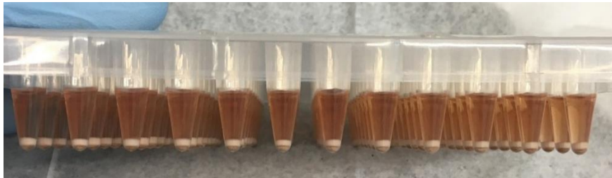
Figure 3. Pelleted precipitate in bottom of wells after spin