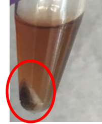
Figure 2 (right) Precipitated material after being spun down from lysis step